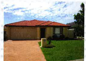
4 Brindabella Crt, North Lakes