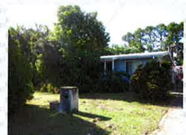
8 Cotterell Rd, Kallangur